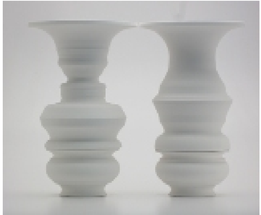
Greg Payce, Passion sur Raison ou Raison sur Passion? 2008

Take a second look at this visual image.